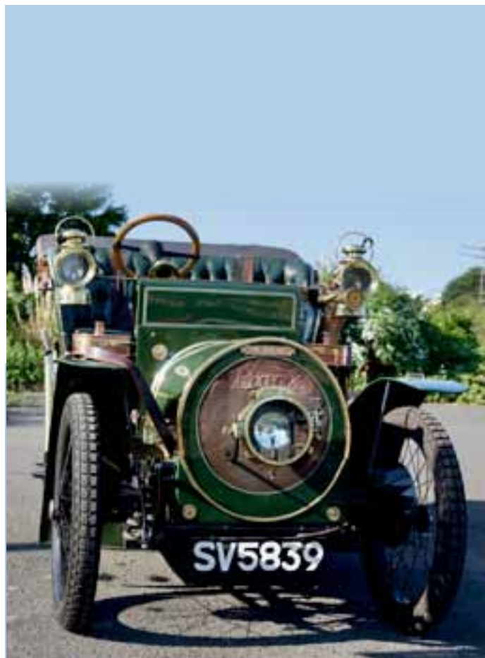
A recent visitor to the village